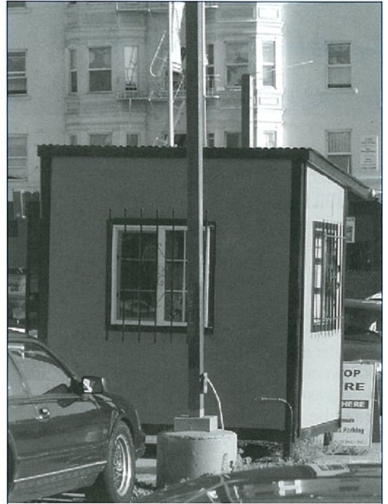
All over town. Modest little shack / But sweet if it kept you dry / On rainy day: roof